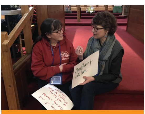
Evangelism training in the United States of America

Episcopalians are reclaiming and embracing the ministry of evangelism, and it is remaking the whole church. As they walk the Way of Love, and practice blessing the world with their stories of life with Jesus, they're helping their neighbors to grow relationship with Jesus, too.